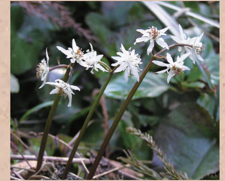
Chinese goldthread (February)