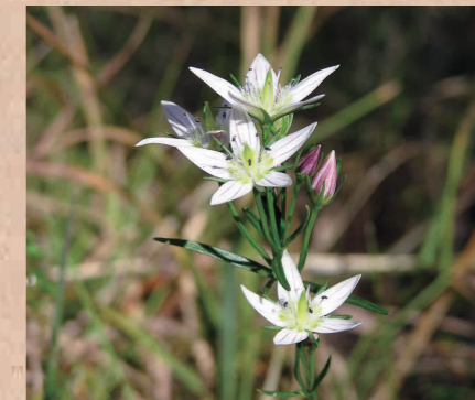
Swertia herb (October)