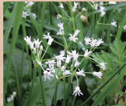
Caloscordum inutile (September)