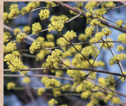
Japanese cornel dogwood (March)