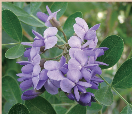
Texas Mountain Laurel (March) (greenhouse)