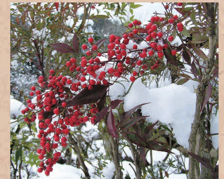
Heavenly bamboo (January)