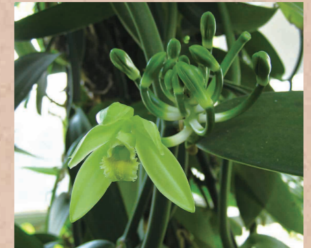
Vanilla (February) (greenhouse)